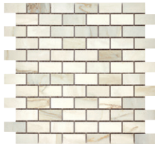
Cedar Point Matt Mosaic