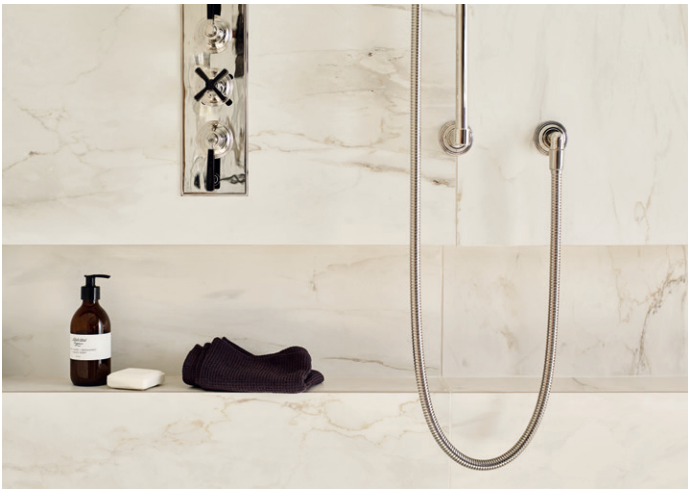
Cedar Point 75x75 Matt

1 COLOUR / 2 FINISHES / 2 FORMATS / 1 MOSAIC