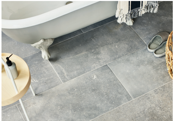
Chateau Cheverny 40x80 Rectified edge