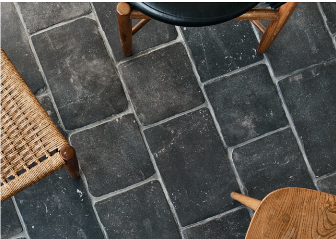
Chateau Villandry Vintage edge Square and Rectangle

3 COLOURS / 1 FINISH / 3 FORMATS / 2 EDGES