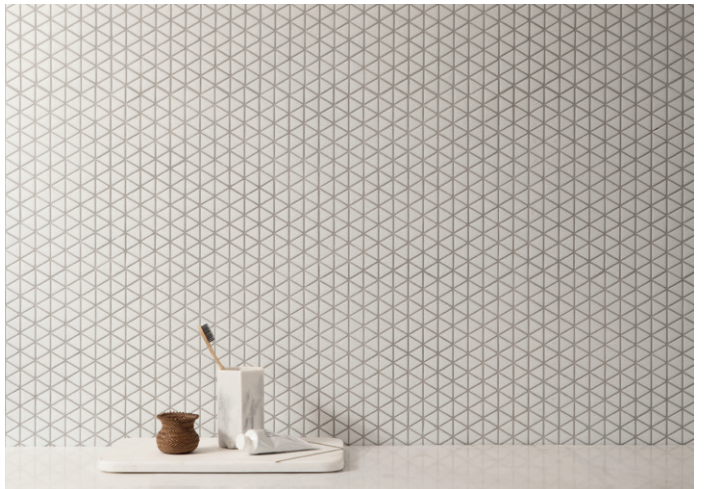
Coconut Triangle Mosaic