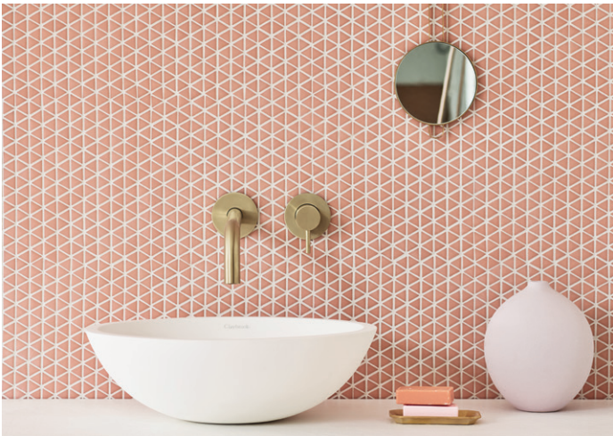
Marshmallow Triangle Mosaic