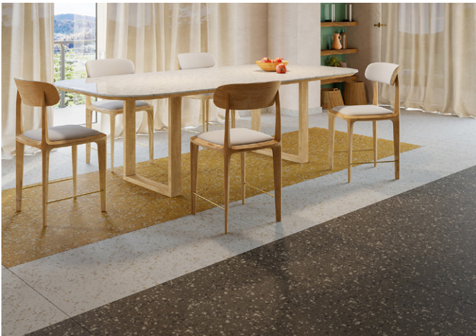
Cornucopia Daisy, Thistle and Sunflower