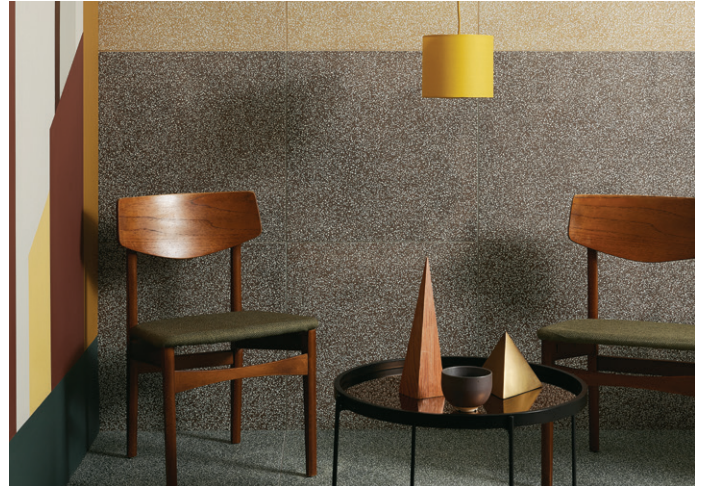
Diavoletti Mango, Moka and Mint