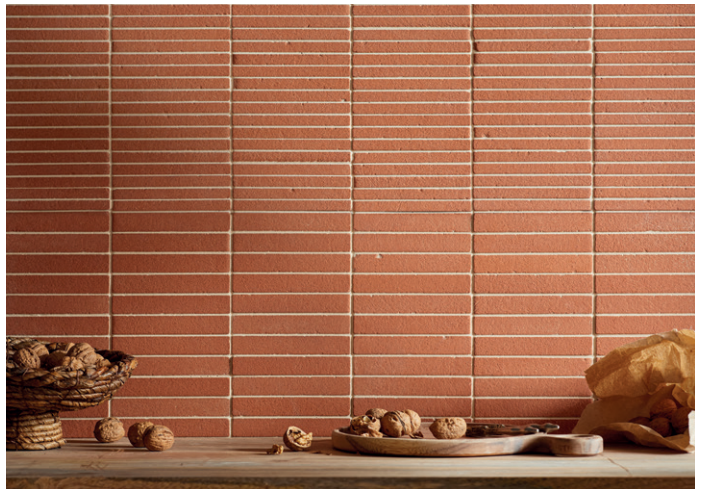
Ema Terracotta Mosaic Forno