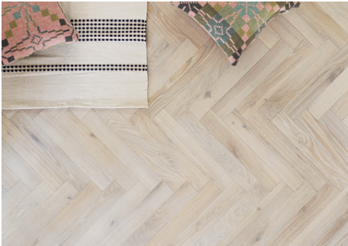
Habitation Parquet Nordic Cottage

5 COLOURS / 1 FINISH / 1 FORMAT / 1 FINISHING PIECE