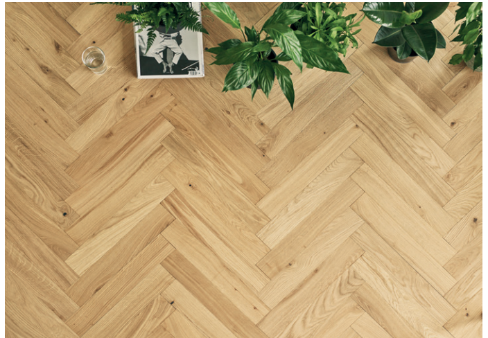
Habitation Parquet Cotswold Manor