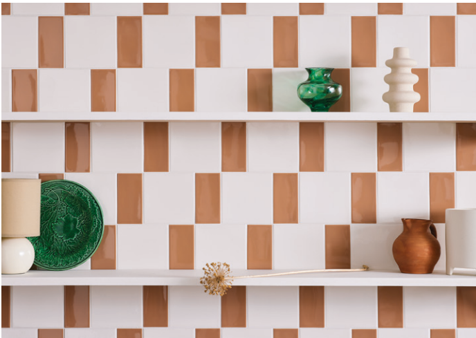
Idillio Clay rectangle and Cream square