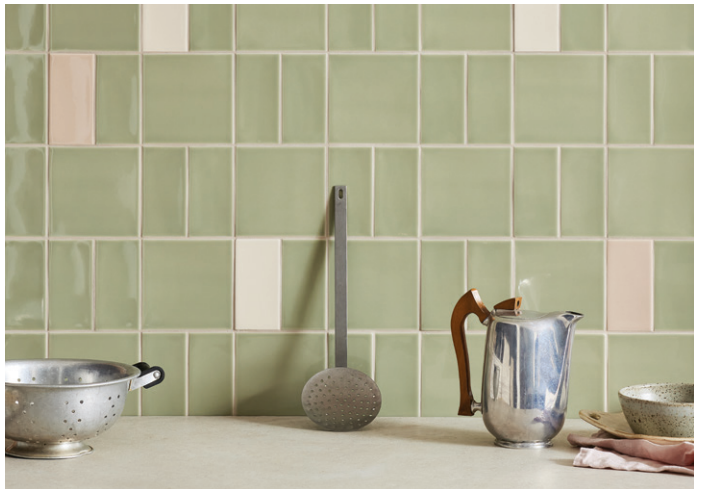
Idillio Olive, Cream and Plaster rectangle, Olive square