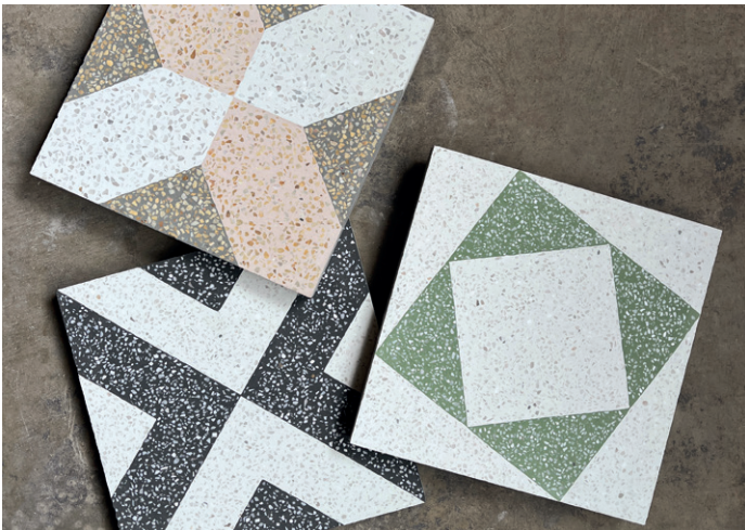
A selection of samples