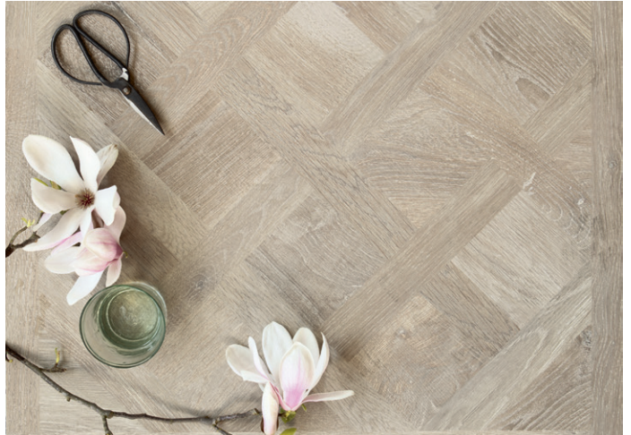
Lucerne Parquet Panel Meggen