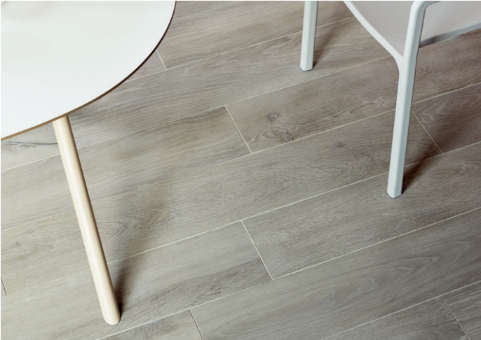
Lucerne Plank Meggen