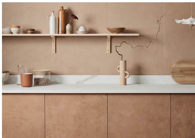
Marmorino Manin and Chiodo