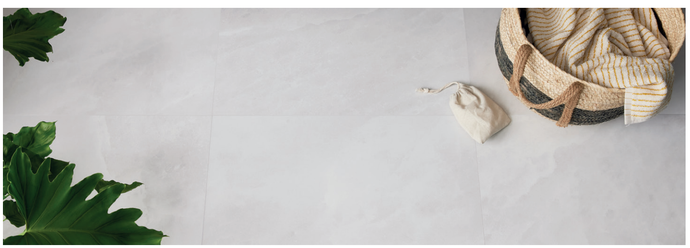
Ocean Onyx Pearl