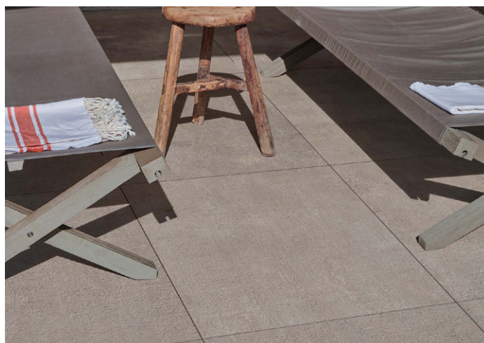
Santuario Cemento Outdoor