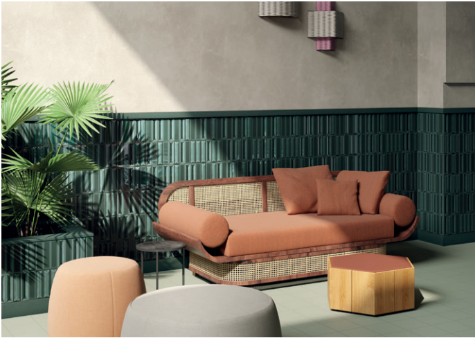
Scolpito Verde Gloss