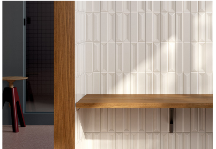
Scolpito Bianco Gloss