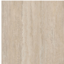
Totana Vein Cut