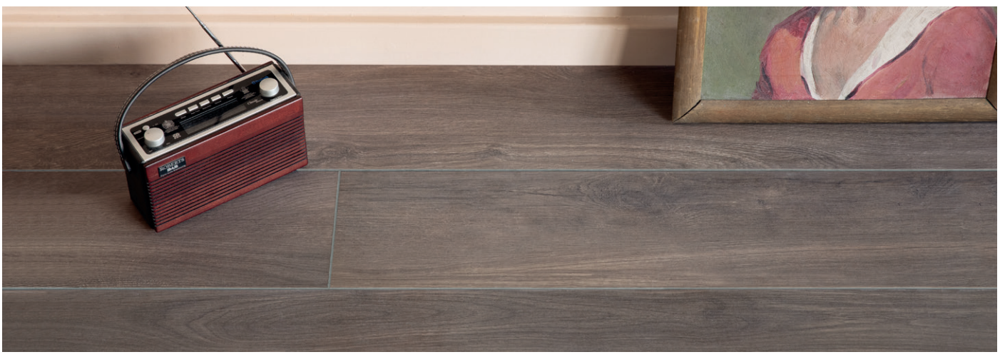
Weekend Cabin Valley