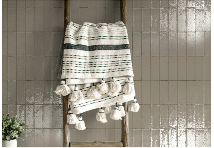
West Ridge Wells