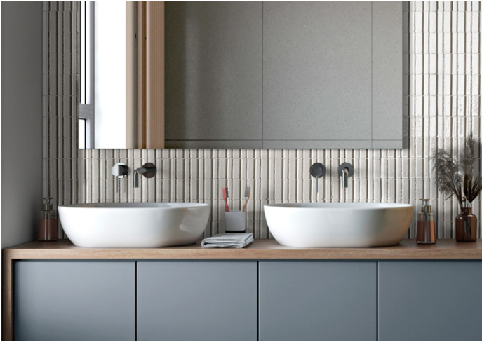
West Ridge Clark Ridged